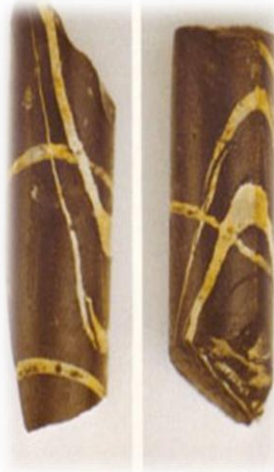
RAPID ROCK GROUTING